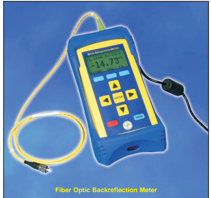
Fiber Optic Backreflection Meter