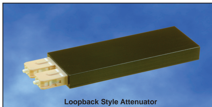
Loopback Style Attenuator