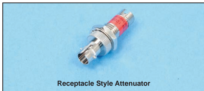
Receptacle Style Attenuator