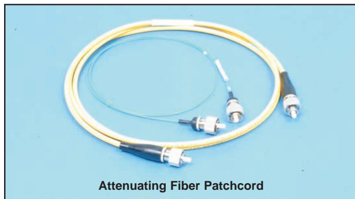
Attenuating Fiber Patchcord