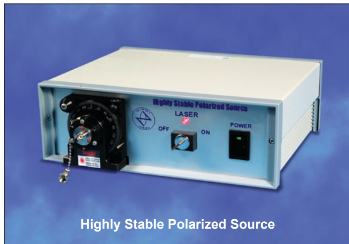
Highly Stable Polarized Source

Accessories include master reference patchcords for confirming the performance of the source, and power cords for regions outside of North America. Extinction Ratio Meters are also available for measuring the output polarization from a fiber. See the data sheet titled Polarization Extinction Ratio Meters for further details.