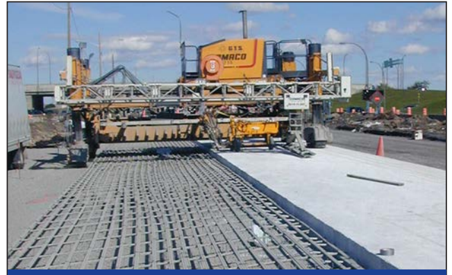
Highway Safety Monitoring