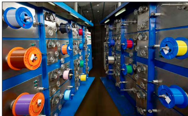
Quality Inspection of Fiber Optic Cable