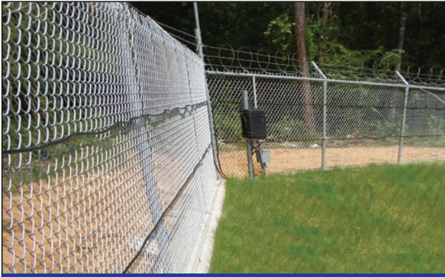
Border Security Monitoring