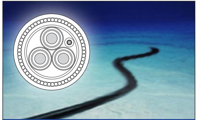
Submarine Cable Monitoring