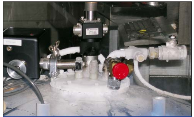
Cryostat Temperature Sensing