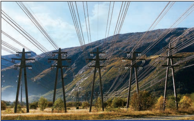
Overhead Power Line Monitoring