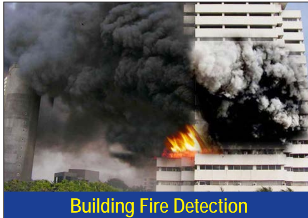
Building Fire Detection