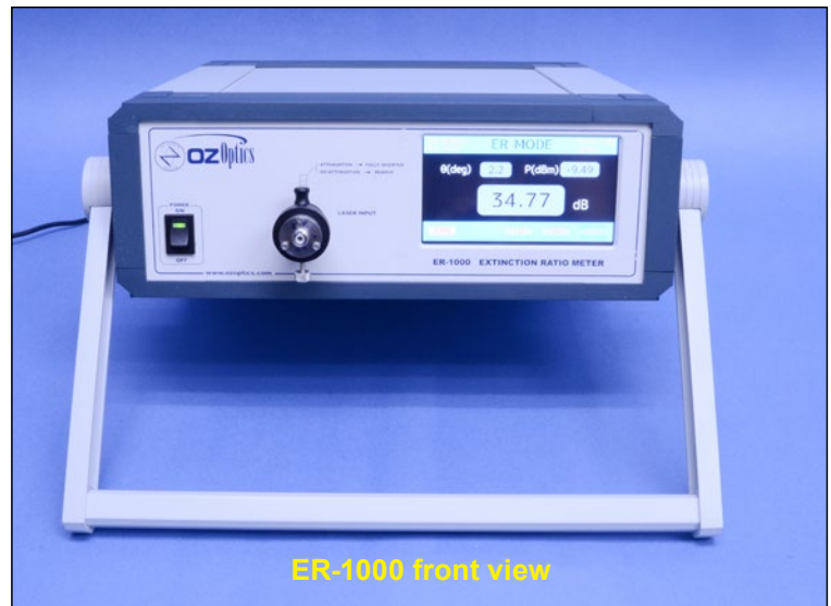
ER-1000 front view

In addition the meter can provide a relative power readout, proportional to the input power in dB. This readout is updated at up to 650 times per second. The computer interface allows the unit to be used with computer control units, for alignment purposes. The combination of polarization and relative power functions allows the unit to be used for complete auto-alignment of polarization maintaining components.