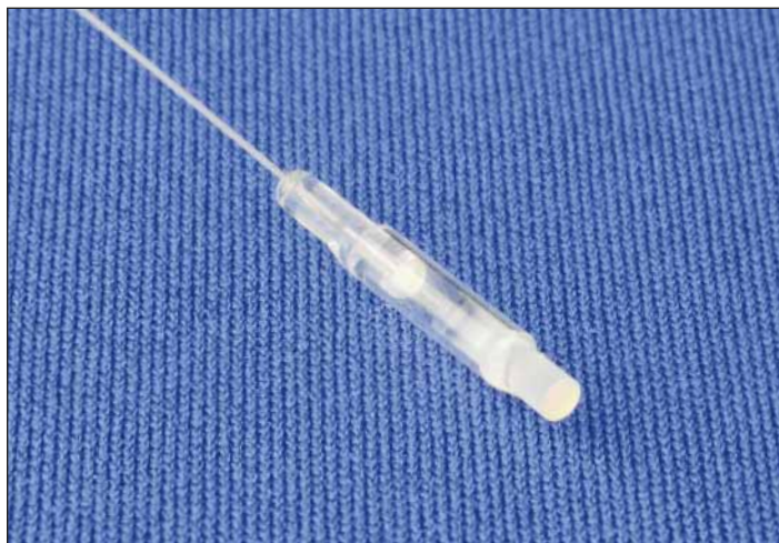
Fused fiber collimator

As these products demonstrate high power handling, parts are an ideal match for fiber laser systems and associated parts such as isolators, filters, beam splitters and combiners, as well as inside integrated assemblies. OZ optics offers these fused fiber collimators as a specialty item, and for detailed specifications please contact us at sales@ozoptics.com