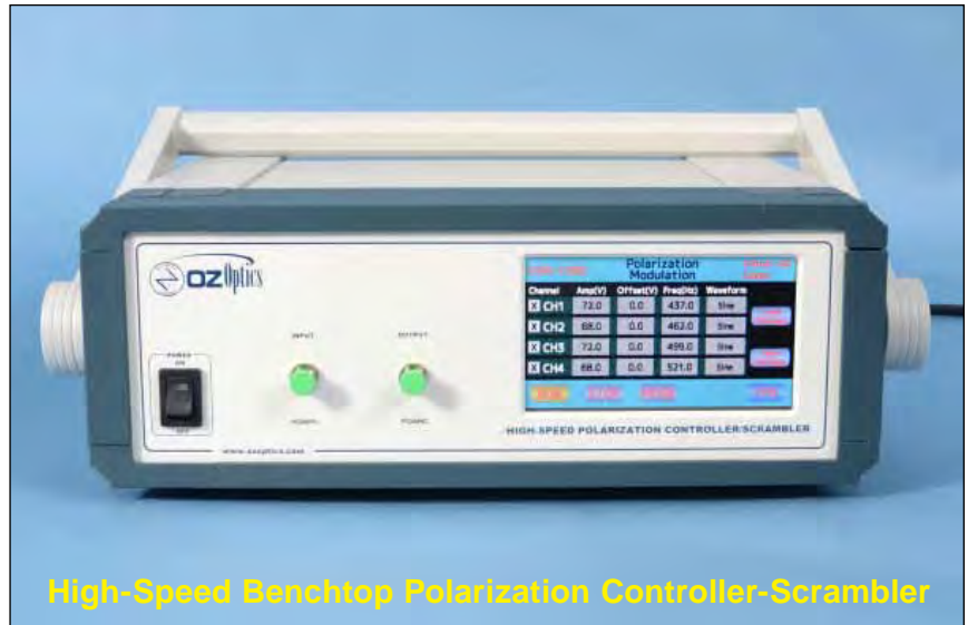
High-Speed Benchtop Polarization Controller-Scrambler