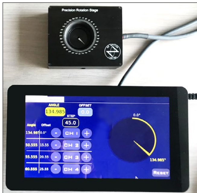
Fig.2: A single rotation stage along with a control unit and built-in touch-screen is powered up using 5V DC power supply.