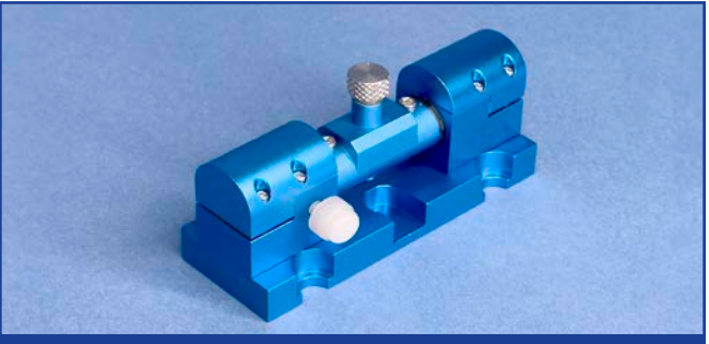
Standard Size In-Line Polarization Controller Without Fiber