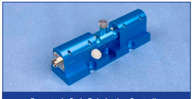
Receptacle Style Polarization Controller