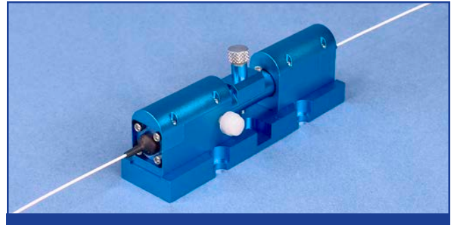
In-Line Polarization Controller With Fiber